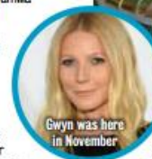
Gwyn was here in November

With its unique architecture, vibrant nightlife and seaside location, it's no wonder this Spanish city is a Mecca for celebs. Beyoncé Knowles, Cameron Diaz and Gwyneth Paltrow have all visited recently. WHAT TO DO: Start with a stroll up Las Ramblas, the bustling central avenue that's lined with quirky stalls, street performers and countless opportunities for a tapas pit stop! After a trip to famous food market Mercat De La Boqueria, explore the narrow streets of Bari Gòtic, filled with cute cafés and tempting boutiques. The chilled-out Gràcia quarter is dotted with picturesque little squares and overlooked by the other-worldly Parc Güell, the creation of Barcelona's most celebrated architect, Antoni Gaudi. His mind-boggling Sagrada Família - a church started in 1882 and still unfinished - is another must-see. Across town on Montjuïc, the hill overlooking the city, you can get your cultural fix at Barcelona's national museum of art (MNAC), then take a cable car back down to the centre. If time is limited, hop on one of Barcelona's frequent tour buses (Barcelona.city-tour.com), which take in all the key sights in around two hours. For a more personal take on the city's secret treasures, Trip4real.com offers intimate guided walks around Barcelona's hidden gems, with friendly, in-the-know hosts showing you