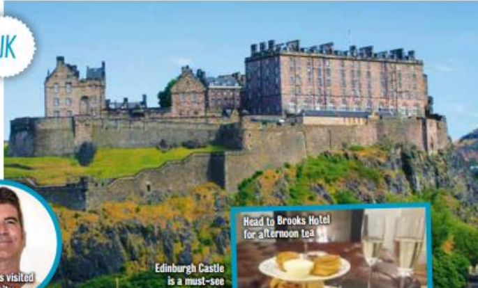
Edinburgh Castle is a must-see