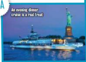
An evening dinner cruise is a real treat