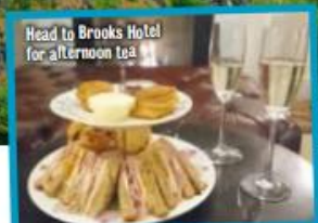
Head to Brooks Hotel for afternoon tea