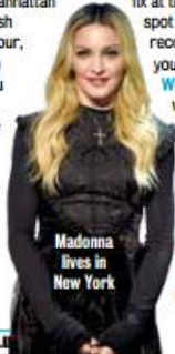
Madonna lives in New York

Walking round New York is a bit like walking round a film set. We recognised the steps in Grand Central Terminal from the Justin Timberlake romcom Friends With Benefits , the entrance to the New York Palace Hotel from TV glamfest Gossip Girl and Brooklyn Bridge from the Miranda and Steve scene in Sex And The City . We also kept our eyes peeled for the city's famous residents, but Madonna was clearly not in the mood for a jog in Central Park while we were there! WHAT TO DO: No visit to the Big Apple would be complete without seeing a show on Broadway, and we chose Kinky Boots , which is a sequintastic, humour-loaded musical. We loved it! Another must is to get up high for a bird's-eye view of the famous Manhattan skyline. If you're feeling flush, splash out on an exhilarating helicopter tour, which not only takes you up above the skyscrapers but also gives you a fantastic view of the Statue Of Liberty. For a more purse-friendly option, head to observation deck Top Of The Rock, which overlooks Central Park in one direction and the Empire State Building in the other. The views are breathtaking. Back down in the park, we headed to Wolman Ice Rink,