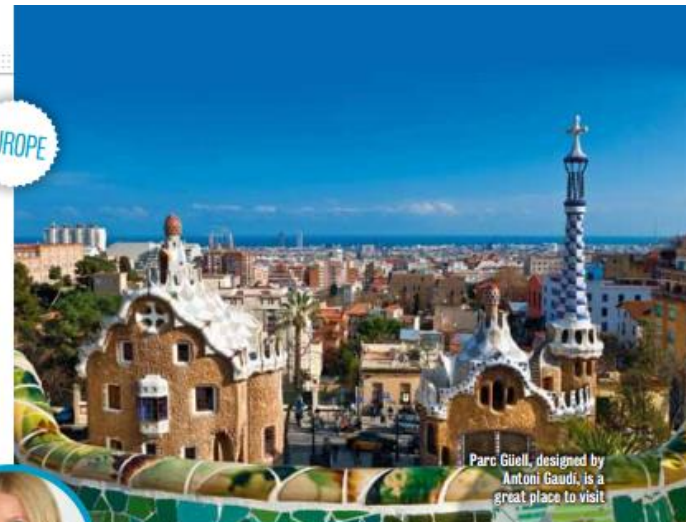
Parc Güell, designed by Antoni Gaudi, is a great place to visit

hotspots you may miss if left to your own devices! WHERE TO EAT: El Nacional is a temple of gastronomy with four restaurants and bars under one roof, allowing you to sample a host of Spanish specialities in one go. For a night-time tippie, head to hipster hangout Garage Beer Co, which draws an easy-on-the-eye local crowd. WHERE TO STAY: We took advantage of Lastminute.com's Top Secret Hotel deal, which