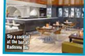
Sip a cocktail at the bar at Radisson Blu

WHERE TO STAY: Based in the heart of the city centre, the newly refurbished Radisson Blu is the perfect base from which to explore. The rooms are large and stylish, and there's even a pillow menu so you can make your stay as comfy as possible! We highly recommend the cocktails in the hotel bar - and there's a hearty breakfast buffet every morning, which will sort you out if you've overdone it the night before. HOW TO BOOK: See Ba.com for flights from £88 return, Radissonblu.com for accommodation from £99 per night and Thisisedinburgh.com for more information on the city.